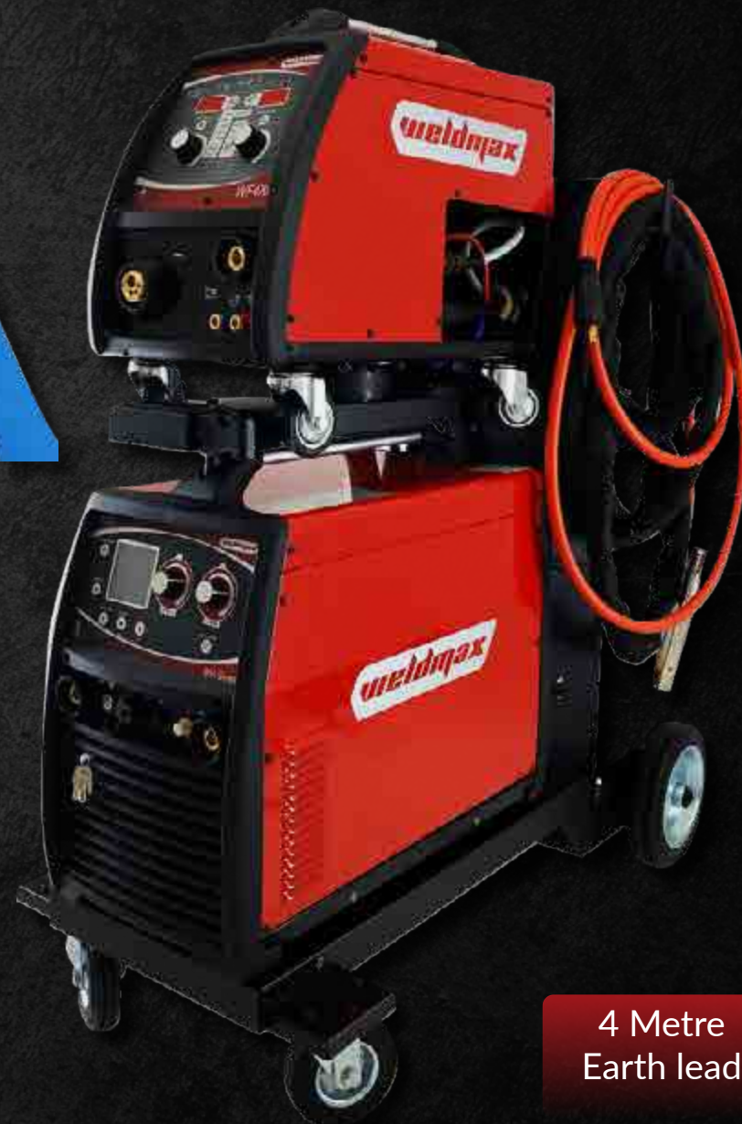
4 Metre Earth lead