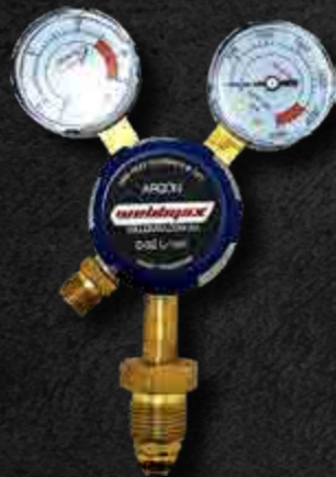
Gas regulator & Hose