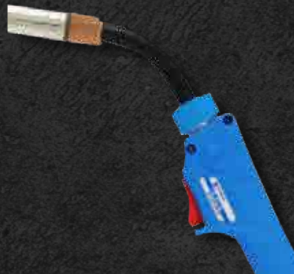
4 Metre Torch