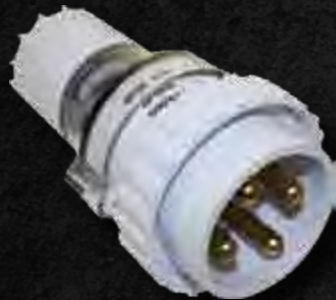
415V 3 phase Plug