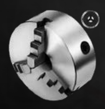
200 MM 3 JAW CHUCK K11-200