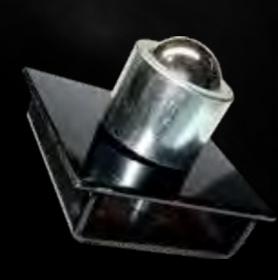
BTA ball transfer head