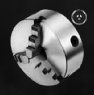
160MM 3 JAW CHUCK K11-160