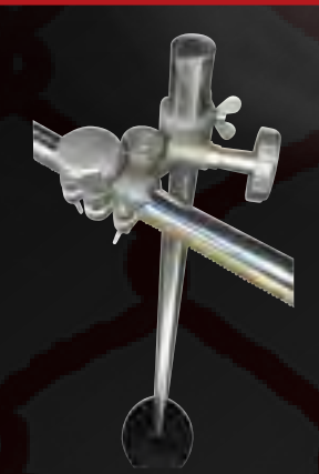
TORCH HOLDER 1000H X 400W TH350