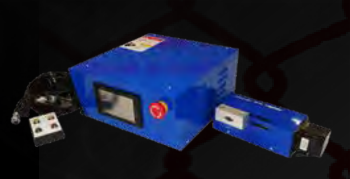
BD-L LINEAR WELDING OSCILLATOR UNIT ED-WLS