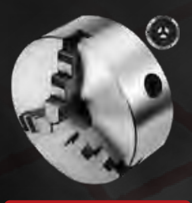
200 MM 3 JAW CHUCK K11-250